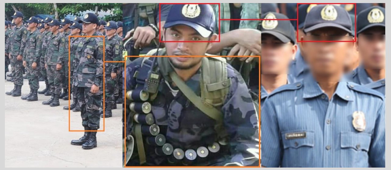
2016 bearing TATUH's name. In a second post, of the same image, TATUH tags the image with the quote "Never Surrender". TATUH posting this photo in uniform is essentially saying to the Philippine government there is nothing you can do to me.